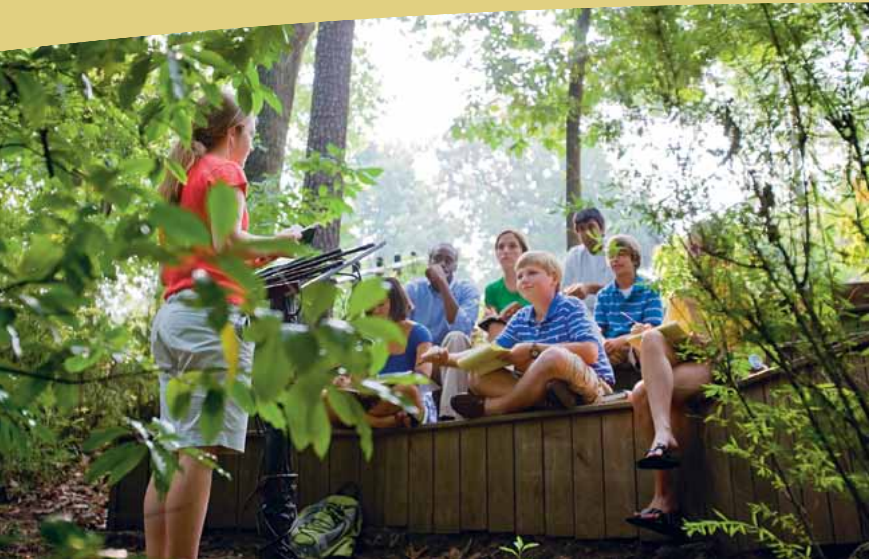
The outdoor classroom provides an ideal setting for good discussions and new discoveries.