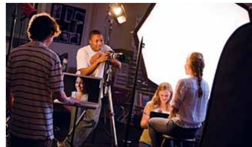
Friendships formed at Altamont often last a lifetime.

At Altamont, athletes act in plays, science whizzes sing in the choir, debaters write for the paper, and on and on. As a result, students aren't pigeonholed or stereotyped. All activities are considered cool; all notable achievements are celebrated.