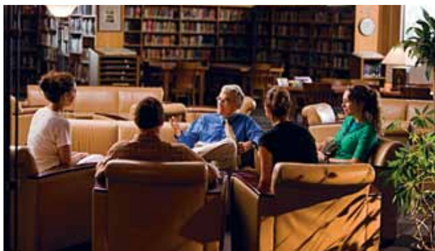
In small classes, students feel free to express opinions, take stands, let their voices be heard.

“OUR STUDENTS ARE WELL PREPARED WHEN THEY GO ON TO COLLEGE BECAUSE THEY KNOW HOW TO READ AND WRITE AND THINK. THEY HAVE BEEN CHALLENGED AT ALTAMONT BY EXCELLENT TEACHERS.”