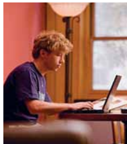
One student plus one laptop can add up to new discoveries.

Because of the rigorous academic demands, students need to feel supported. And they do. Every student matters at Altamont; every student’s academic problems get addressed. No one falls through the cracks. The teachers want every single student to succeed. All they ask in return is that students strive to give their very best at all times.