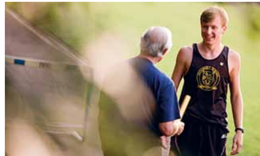
“Give it your best” serves as the Altamont mantra at all times, in all fields.

ALTAMONT'S TRADITION OF EXCELLENCE EXTENDS TO ALL FORMS OF ATHLETIC ENDEAVORS, WHETHER IT'S KICKING A SOCCER BALL, RETURNING A TENNIS SERVE, OR RUNNING A MILE.